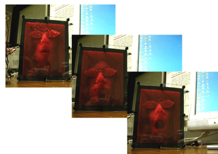
Figure 2 : The concept of "Face Phone."