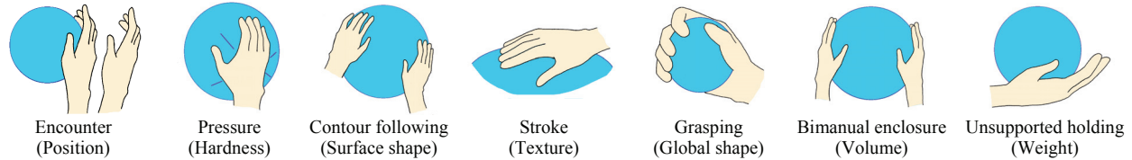
Figure 1: The categorized behaviors and perceptions that are represented by our proposed method.